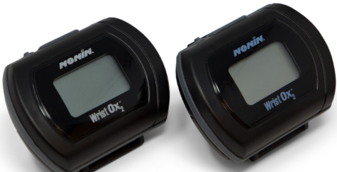
Model 3150 with USB Model 3150 with BLE